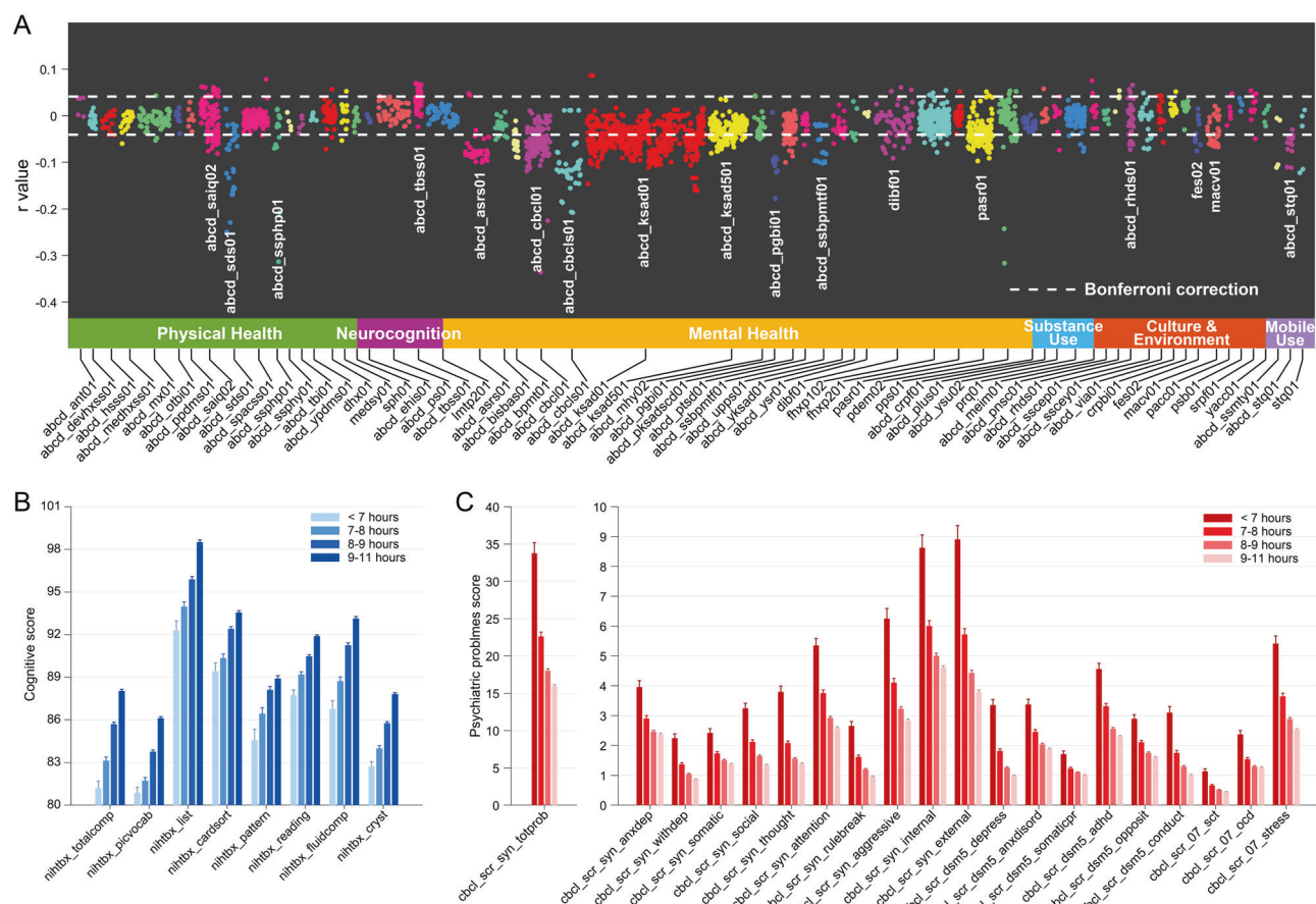
Fig. 1 Sleep duration, and cognitive and psychiatric problems scores. a The correlation between sleep duration and a wide variety of measurements including physical and mental health, neurocognition, substance use, culture, environment and mobile technology, etc. Here we highlight the 17 measurements that are significantly correlated with sleep duration. For example, the positive r value for the cognition scores indicates that long sleep duration is positively correlated with good cognition. The full names for these measurements are shown below and the details for each item are provided in Table S1. b A histogram showing the relation between the number of hours of sleep and cognitive measures. The Y axis is the cognitive score and the error bar is the standard error of the mean (SEM). There was a significant correlation between the cognitive score and the number of hours of sleep (Bonferroni corrected, p < 0.05 ). The children with long sleep duration tended to have good cognitive performance. c A histogram showing the relation between the number of hours of sleep and the psychiatric problems scores. The Y axis is the psychiatric problems score and the error bar is the SEM. There was a significant negative correlation between the psychiatric problems scores and the number of hours of sleep (Bonferroni corrected, p < 0.05 ). The children with short

sleep duration tended to have high psychiatric problems scores. abcd_saiq02 ABCD Parent Sports and Activities Involvement Questionnaire (SAIQ), abcd_sds01 ABCD Parent Sleep Disturbance Scale for Children, abcd_ssphp01 ABCD Sum Scores Physical Health Parent, abcd_tbss01 ABCD Youth NIH TB Summary Scores, abcd_asrs01 Adult Self Report summary scores, abcd_cbcl01 ABCD Parent Child Behavior Checklist Raw Scores Aseba (CBCL), abcd_cbcls01 Child Behavior Check List summary scores, abcd_k-sad01 ABCD Parent Diagnostic Interview for DSM-5 Full, abcd_k-sad01 ABCD Parent Diagnostic Interview for DSM-5 Full (KSADS-5), abcd_ksad501 ABCD Youth Diagnostic Interview for DSM-5 (KSADS-5), abcd_pgbi01 ABCD Parent Parent General Behavior Inventory-Mania, abcd_ssbpmtf01 ABCD Summary Scores Brief Problem Monitor-Teacher Form for Ages 6–18, dibf01 ABCD Parent Diagnostic Interview for DSM-5 Background Items Full, pasr01 ABCD Parent Adult Self Report Raw Scores Aseba, abcd_rhds01 Residential History Derived Scores, fes02 ABCD Parent Family Environment Scale-Family Conflict Subscale Modified from PhenX, macv01 ABCD Parent Mexican American Cultural Values Scale Modified, abcd_stq01 ABCD Youth Screen Time Survey.